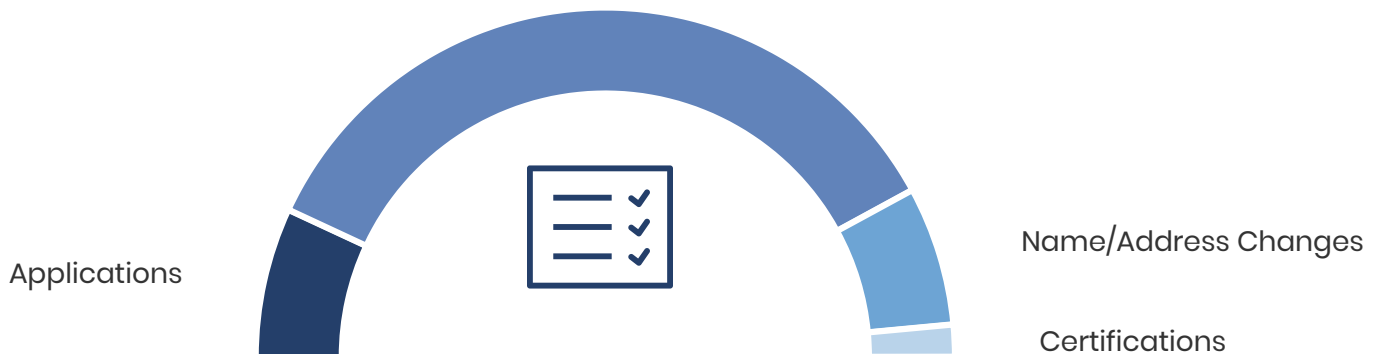
Renewals + Reinstatements